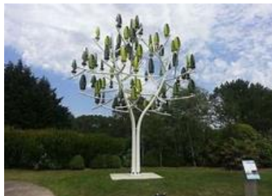
An example of a tree wind turbine