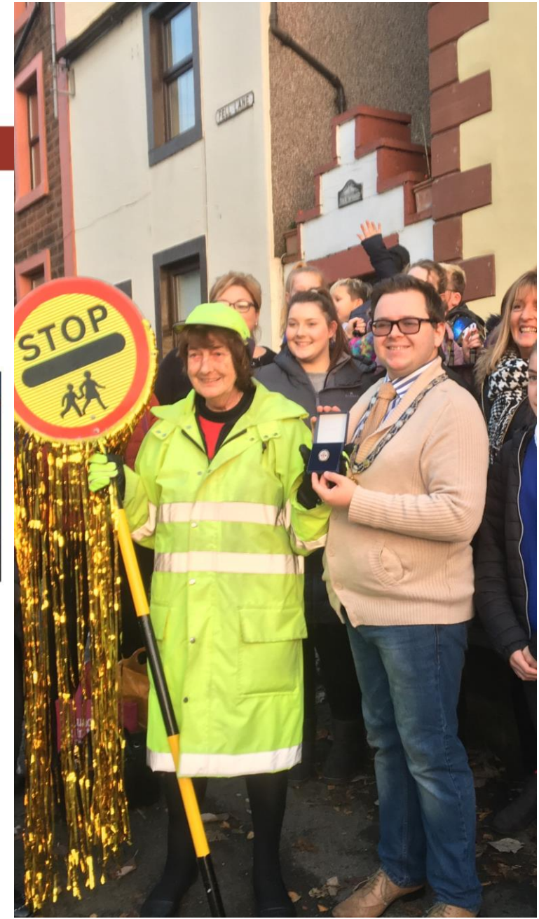
Awarded by the Mayor for outstanding community work

The Town Council has been participating in the Devolution of Assets and is now responsible for the Cornmarket Bandstand, Fairhill Playing Field, St Andrews War Memorial, Musgrave Monument, Morrisons Bring Site, Bus Shelters and Seats and Benches. The Council are currently seeking to progress the transfer of Coronation Gardens and have had an expression of interest for the transfer of land known as 'Thacka Glen' approved by Cumbria County Council, which is hoped will transfer in the coming months. As we take over more assets in the town from Eden District Council, we will strive to maintain and further improve those services.