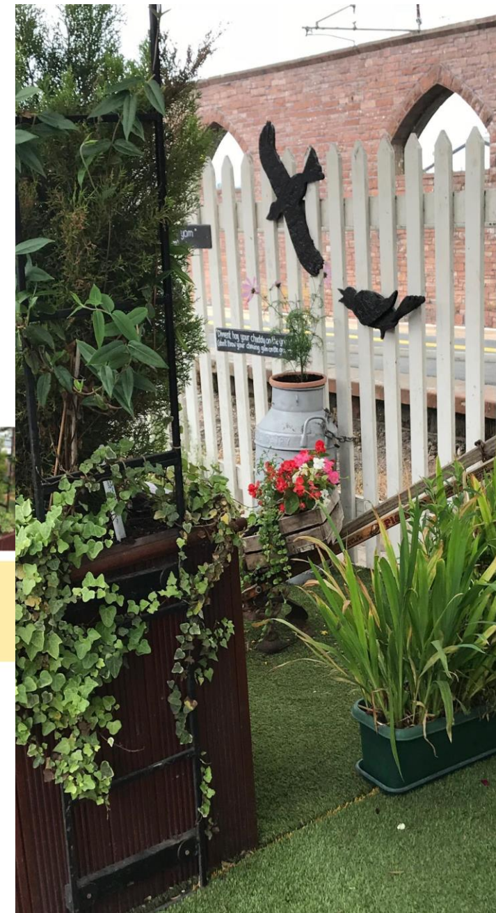
A Penrith Community Gardeners installation