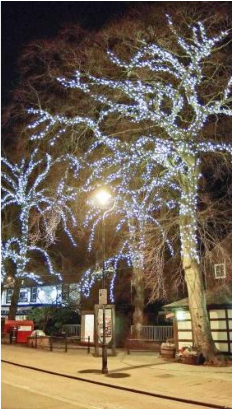
As sponsors we help light up Penrith for Christmas

Funding has supported playground improvements, outdoor pursuits for young people, flight simulator for air cadets, Penrith Football and Cricket Clubs and music drop-ins, as well as projects run by Cumbria Youth Alliance.