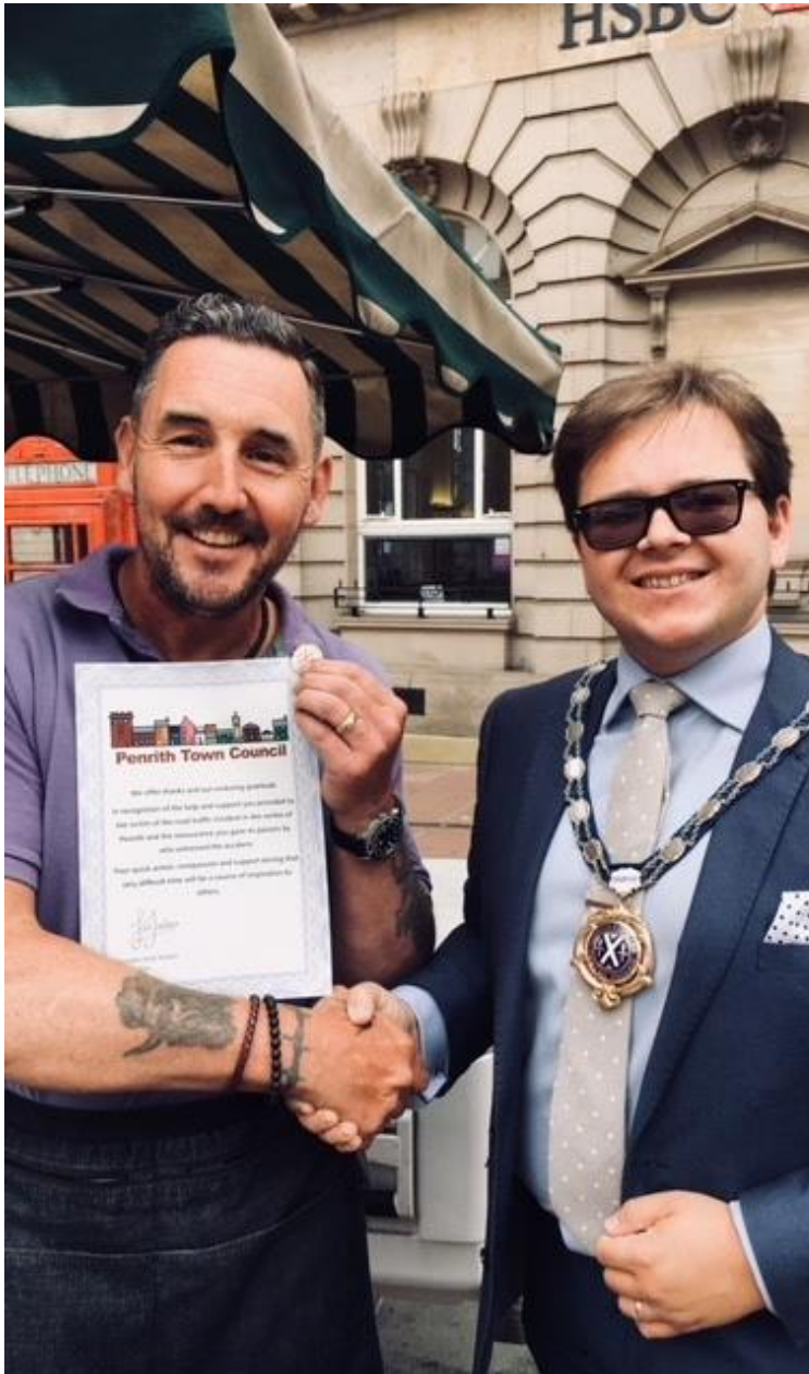
Penrith Mayor's Medal Recipients 2019