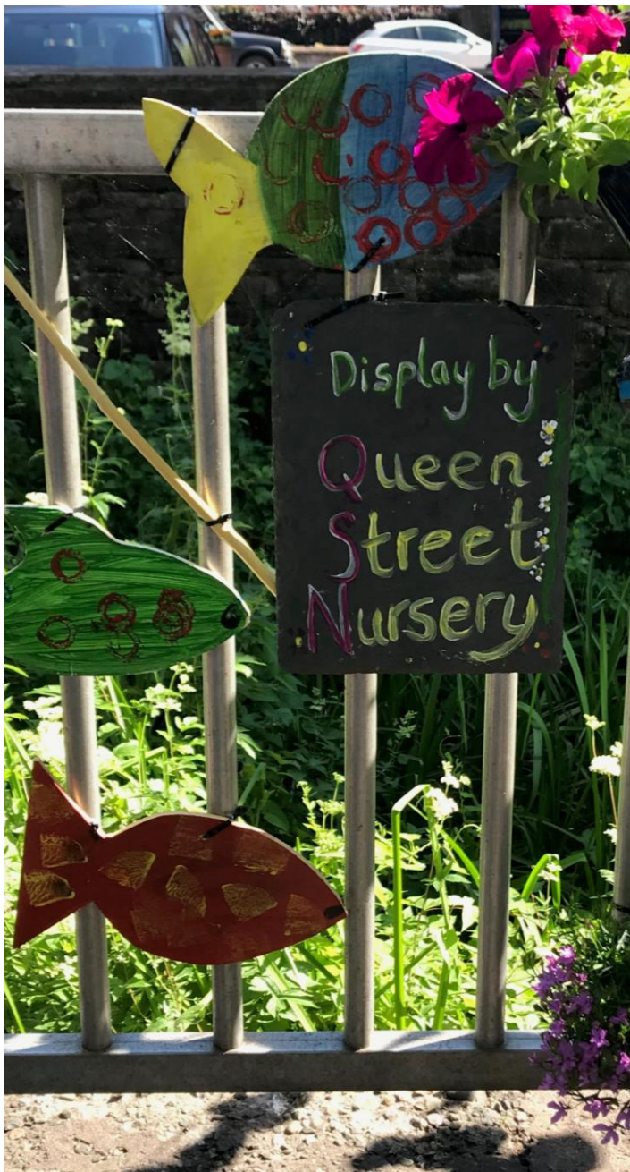
Everyone is encouraged to take part for In Bloom