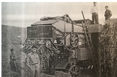
Figure 5. Agricultural Camps

A number of volunteers from RGS got involved in Farm Camps situated close to Penrith. One such was in Skirwith about six miles east of Penrith and another was started at Calthwaite, a small village about 6 miles North of Penrith. Some of the boys lived in the empty mansion called Calthwaite Hall. Another camp was established at Ainstable, about ten miles from Penrith. Some of the boys cycled from their billets in Penrith to work on these agricultural farms.