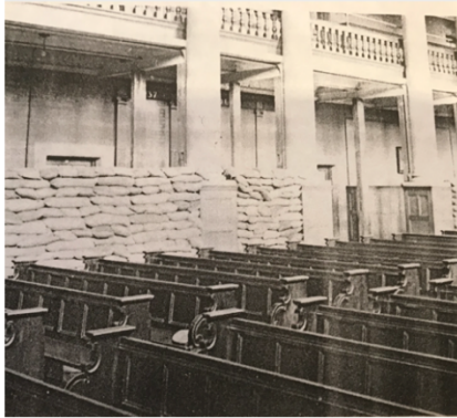
Figure 3 Sandbags in Drill Hall

The Local Defence Volunteers were formed, the forerunners to the Home Guard. Cases of rifles arrived from America and some were unpacked in the School Drill Hall. The rifles had been left over from the 1914-18 war and the Americans had kept them in good condition, sending them to Britain after the British Army had lost most of its arms at Dunkirk.