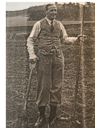
Figure 4 "Digging for Victory" The Headmaster

The Headmaster, who was himself very keen on working on the school allotments to help "Dig for Victory," encouraged the boys who stayed in Penrith over the summer to volunteer and get involved. The allotment field lay to the East of Beacon Road and despite being full of Couch Weed, was divided into working plots.