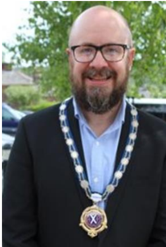
Councillor Doug Lawson Mayor of Penrith