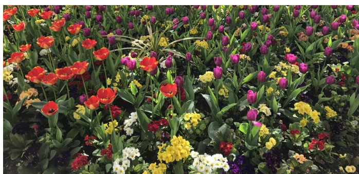
PENRITH FLOWERBED SPRING 2019

with extracts from our 2019-20 Annual Report