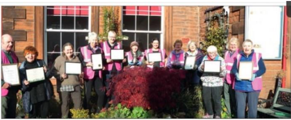
GREAT GROWERS: Community gardeners were recognised for growing fruit and veg throughout the town.